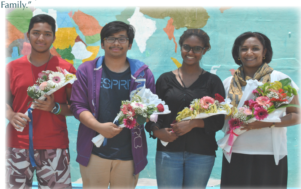
The Ericsson Winners!

This is a proud moment for our school and for the KAS